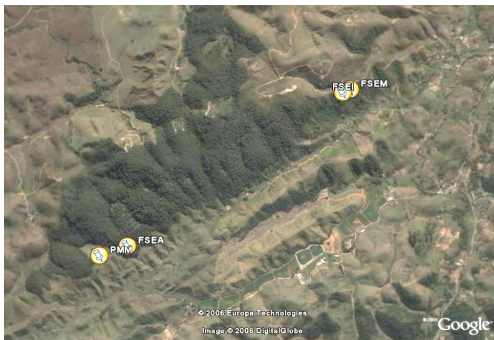
Figure 1. Location of the studied sites, Pinheiral, Rio de Janeiro, Brazil.