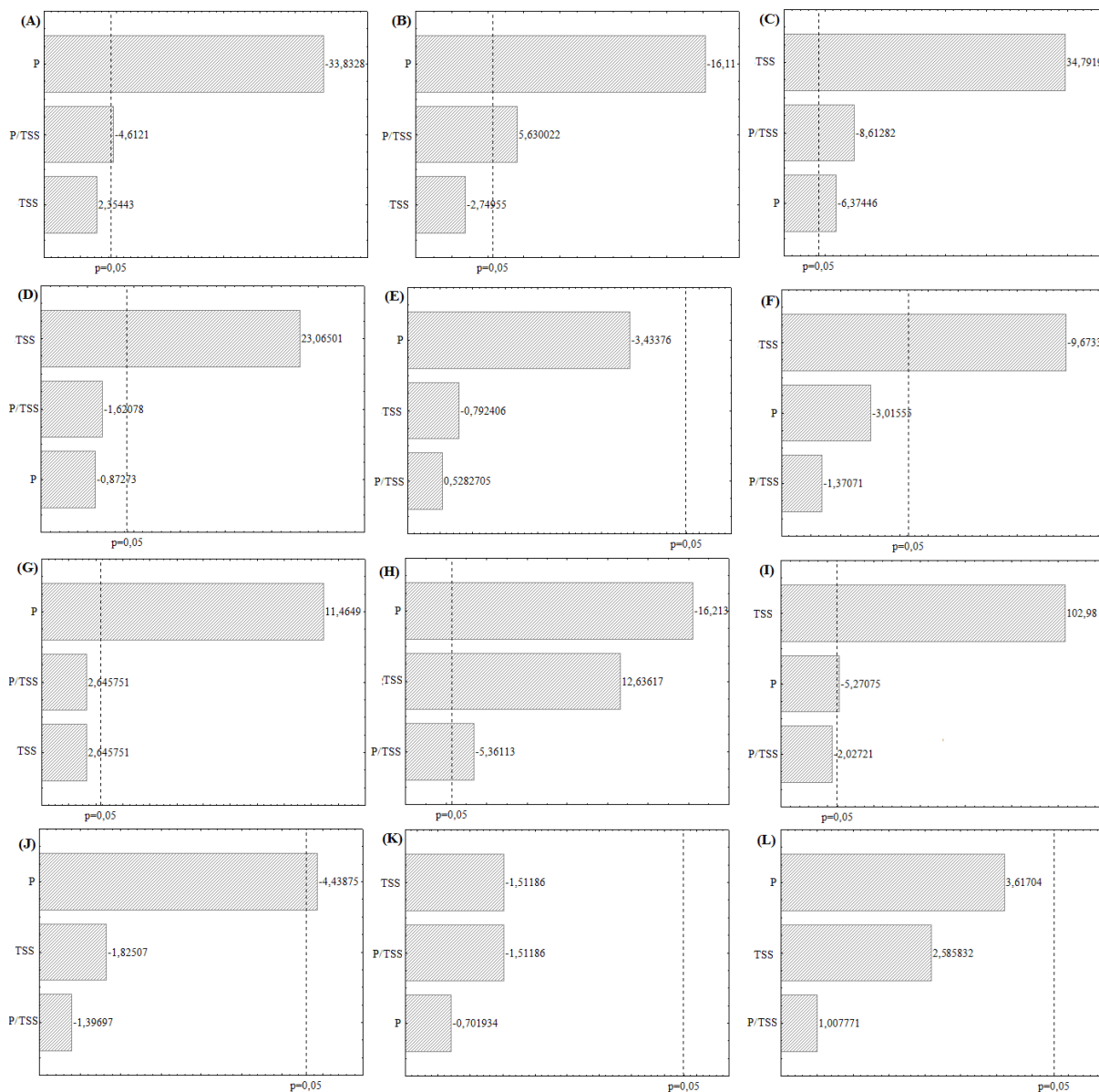
Figure 1. Pareto diagram for the influence of the factors of pulp (P), total soluble solids (TSS) of the syrup and their interaction (P/TSS) on the income (A), alcohol content (B), dry residue (C), TSS (D), pH (E), water activity (F), total titratable acidity (G), TSS/total titratable acidity ratio (H), total sugars (I), luminosity (J), red intensity (K) and yellow intensity (L) of the soursop liquors.