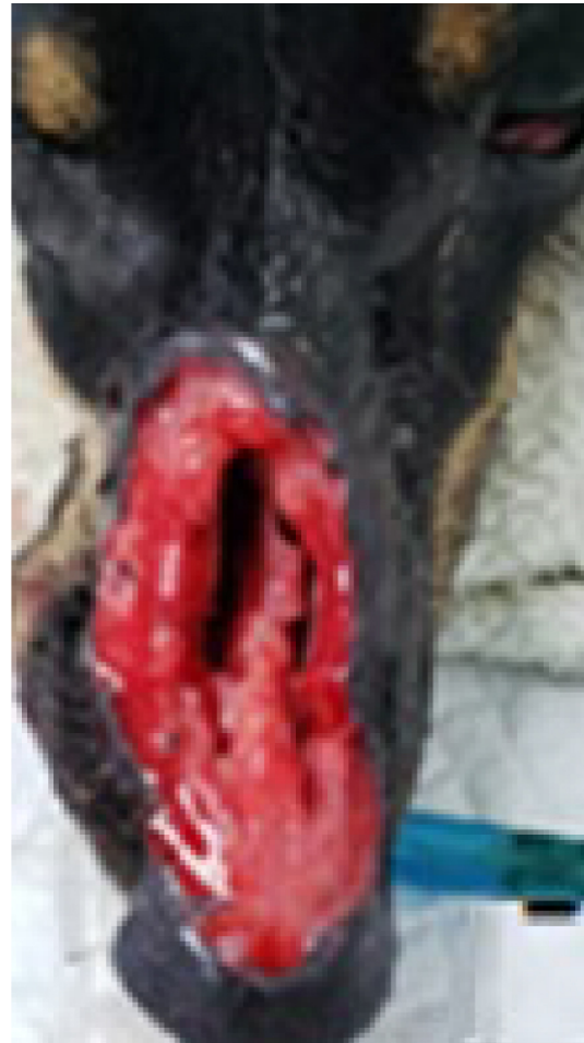
Figure 2. Erosive wound (10.0 cm × 4.0 cm) with exposure of nasal cavity (surgery day).