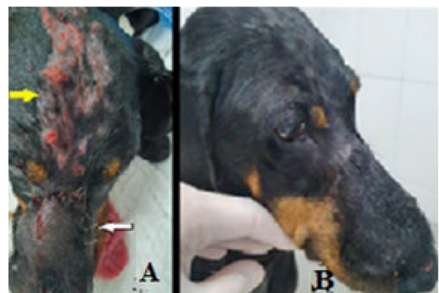
Figure 5. Alopecia and small wounds in the region of the anchorage suture (yellow arrow), and the sutures of the proximal extremity of the tube after incision (white arrow) (3 rd stage) (A), fourteen days after the last surgery.