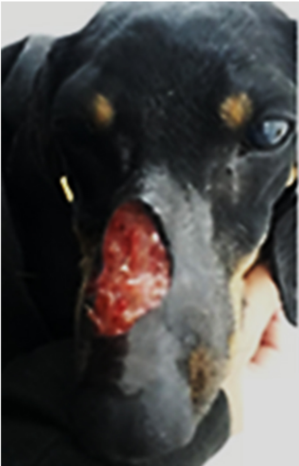
Figure 1. Ulcerative wound with 8.0 cm × 3.0 cm in the dorsal nasal region (seven days before surgery).

In all stages, the pre-surgical antisepsis was performed using chlorhexidine (2%) followed by surgical antisepsis with an aqueous solution of chlorhexidine. During the surgery, the dog remained in ventral recumbence, and after it, the surgical wounds were treated with an aqueous solution of chlorhexidine