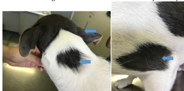
Figure 1. Bicolor (white and black), Fox Paulistinha, male, with approximately 7 months of age, presenting alopecia on the outside surface of the pinna and dorsal head region and other areas of black hair (arrows).

The follicles exhibited moderate atrophic/dysplastic pattern with intense melanic accumulation between the lamellar keratin, associated with the deposition of melanin in the follicular contours. Sometimes, there was dense melanin eviction within the adipose tissue. These histopathological findings featuring follicular dysplasia associated with melanic accumulation in the hair shaft and in and deep dermal tissue led to the final diagnosis of black hair follicular dysplasia.