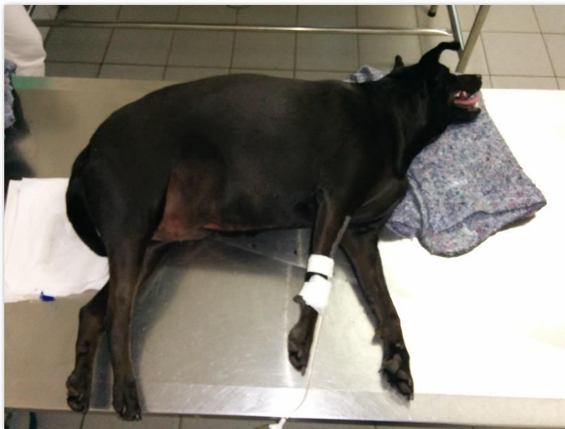
Figure 1. Canine one hour after trauma at lateral recumbence showing forelimb spasticity and flaccid to normal hindlimb. Additionally, dorsal flexion of neck can also be seen.

At physical examination no significant change was detected. On neurologic evaluation, we noted non-ambulatory paraparesis, with Schiff-Sherrington position (Figure 1). Patellar, cranial tibial, ischiatic and, gastrocnemius reflex found to be increased bilaterally with normal withdraw reflex. Superficial and deep pain perception was preserved, but the first was decreased. The cutaneous trunk muscle reflex was absent after L2. Deep palpation of spinal column revealed hyperesthesia in thoracolumbar transition. Although focal pain sensation, any stimulus in other body parts also elicited pain response (allodynia).