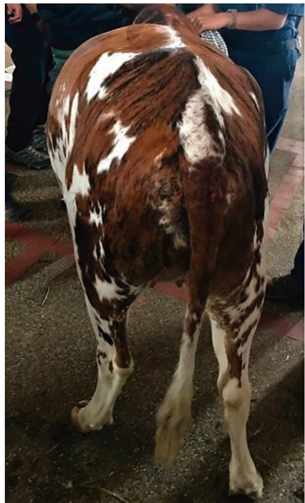
Figure 1. Severe bilateral abdominal distension. The left-sided distension is uniform and extends to the dorsal midline.

At clinical examination the animal showed severe depression, congested mucous membranes with a capillary refill time of 4 seconds, an eyeball sinking of 6 mm, a skinfold return time of 4 seconds, calculated dehydration (>10%), tachycardia (heart rate: 120 beats per minute), a respiratory rate of 22 breaths per minute, a mucopurulent nasal discharge, mixed dyspnea, orthopnea, diffuse crackles in both lungs, coarse crackles in the trachea and respiratory distress. In addition, the heifer had excessive salivation, ventral edema in the head, neck and chest, generalized subcutaneous emphysema that extended by the head, neck and left side (from the scapula to the paralumbar fossa), a marked left abdominal distension associated to a ping sound and ruminal amotility indicative of free-gas bloat (Figure 1). The second cervical third of the esophagus was obstructed at the passage of oro-ruminal probe, and a ruminal trocarization with a 14-gauge x 2-inch needle was performed with gas outlet for 17 minutes.